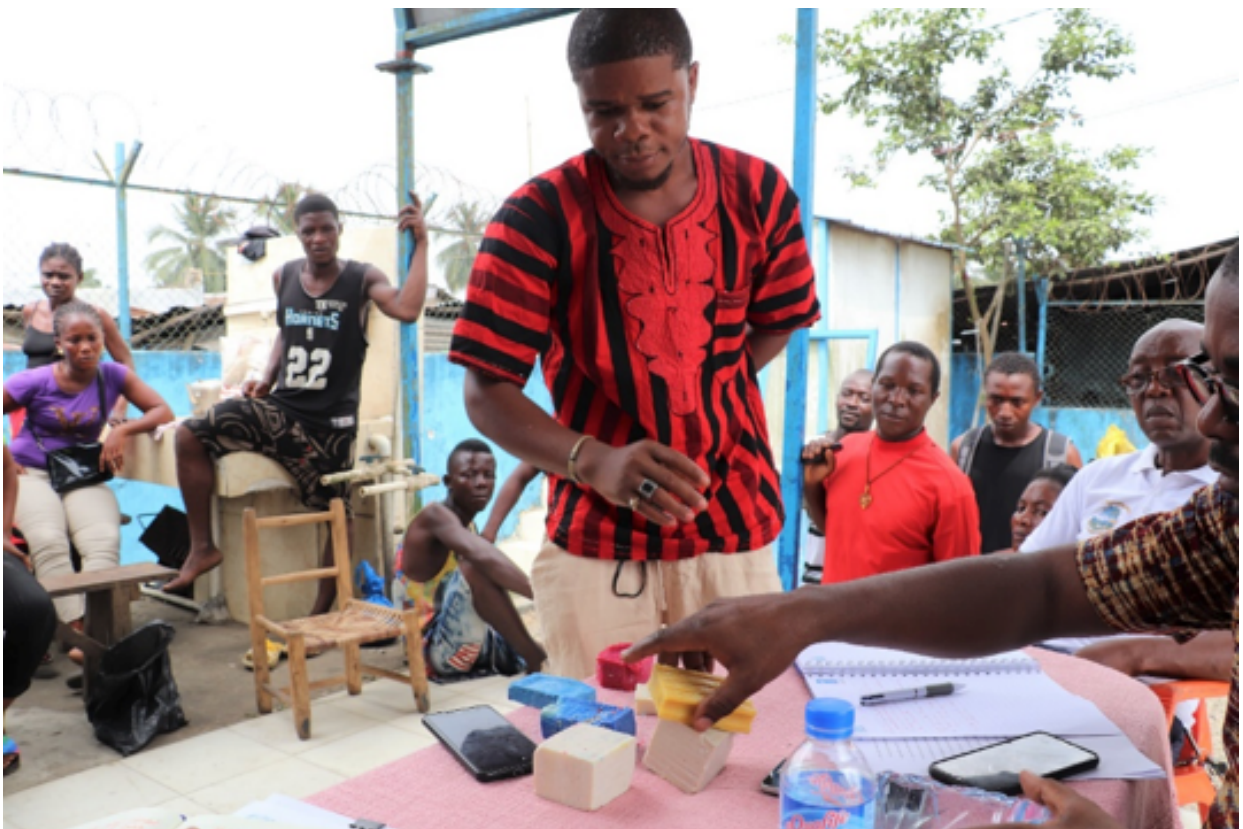
One of the youth trained in soap making shows off some of his products. He has been selling these in the local market.

Going forward: It is hoped that the results of this project, will encourage the Government and other partners to address the issue of disadvantaged youth in Liberia. This could be through the development of a national drug programme and the establishment of a rehabilitation centre to address the problem of drug abuse in the country.