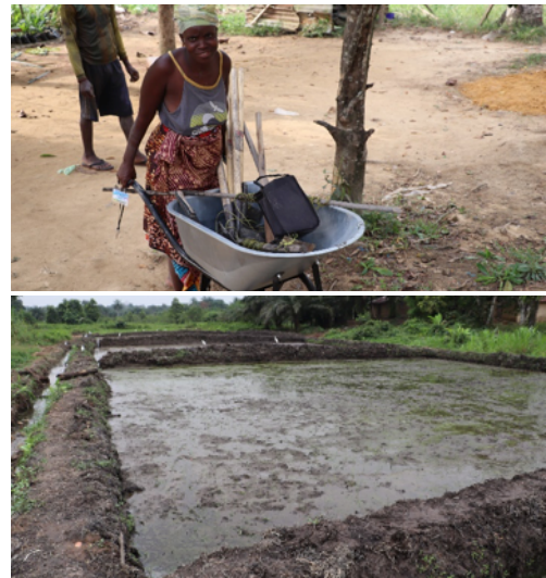
One of the beneficiaries of the project (above) returning from the field after working in their group's rice field (below).

Going Forward: In 2020, the project will support the establishment of inclusive peacebuilding structures for mediation and dispute resolution, which include marginalised groups such as youth and women in six targeted communities in Bong and Lofa. In addition, these communities will be facilitated to engage in agriculture and value addition to ensure sustainable livelihoods and local economic growth.