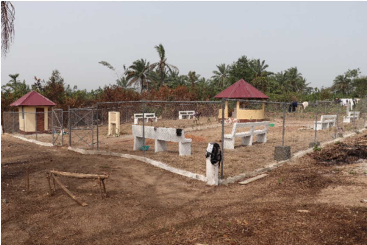
One of the completed memorial sites in Bong County.

Going Forward: The project will continue to engage with oversight bodies on passing more gender responsive laws including the Affirmative Action Bill, FGM Bill and Legal Aid Bill. It will also support the convening of a national reconciliation conference where additional seven county-level reconciliation plans as well as a national reconciliation plan will be endorsed. All the 14 memorials will be completed in 2020.