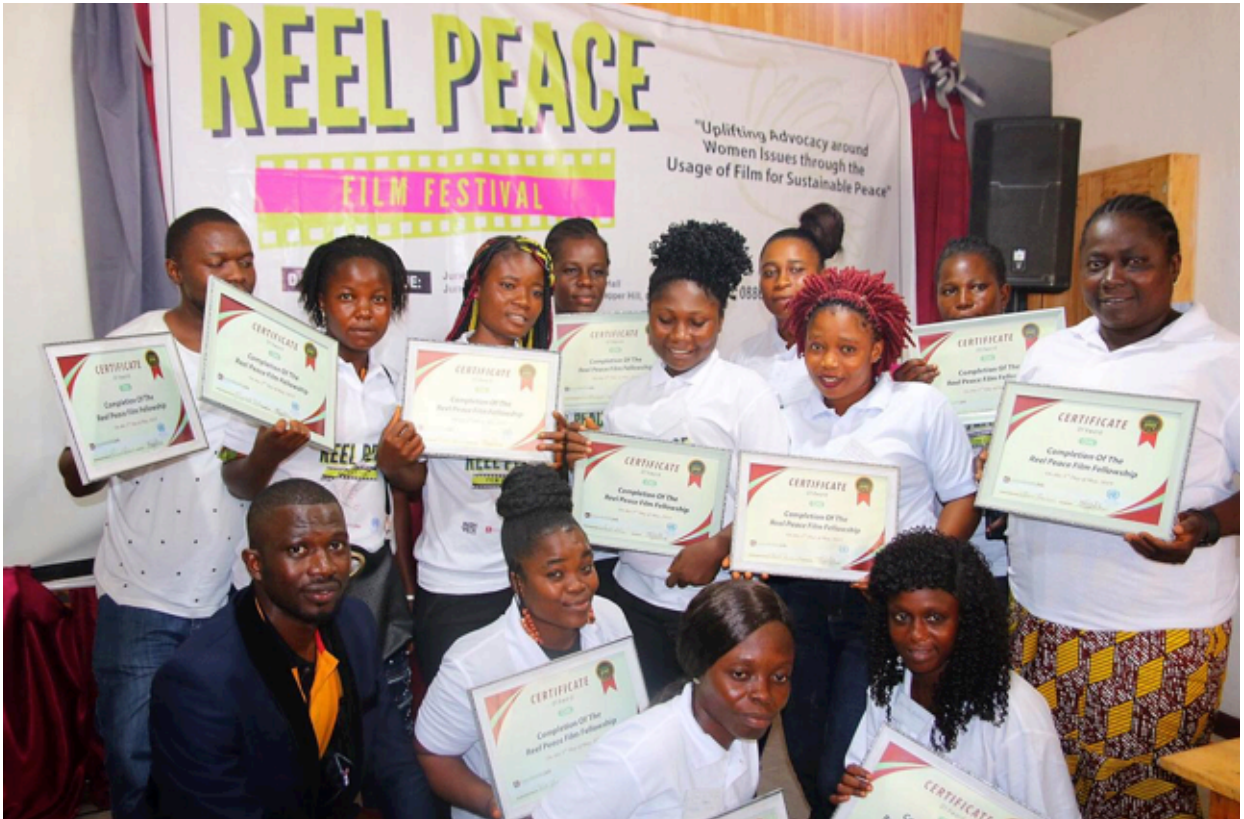
The female film makers trained during the project were awarded certificates after their training.