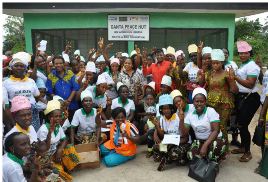
The Ganta Peace Hut women, after dedicating their peace hut.

Additionally, the Project aimed at enhancing women's involvement in decentralizing peacebuilding efforts, such as early warning structures, county and district security councils, and cross-border dialogues. It was implemented in Montserrado, Grand Cape Mount, Bomi, Lofa, Nimba, Grand Gedeh and Maryland counties.