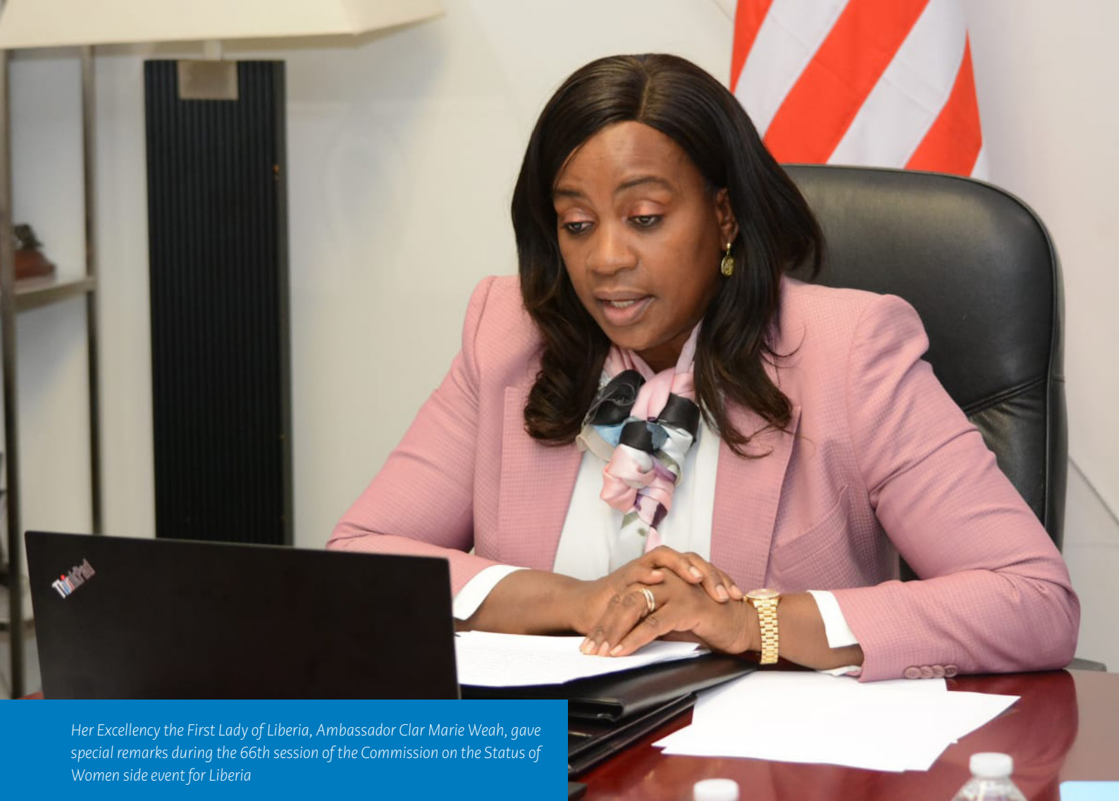
Her Excellency the First Lady of Liberia, Ambassador Clar Marie Weah, gave special remarks during the 66th session of the Commission on the Status of Women side event for Liberia