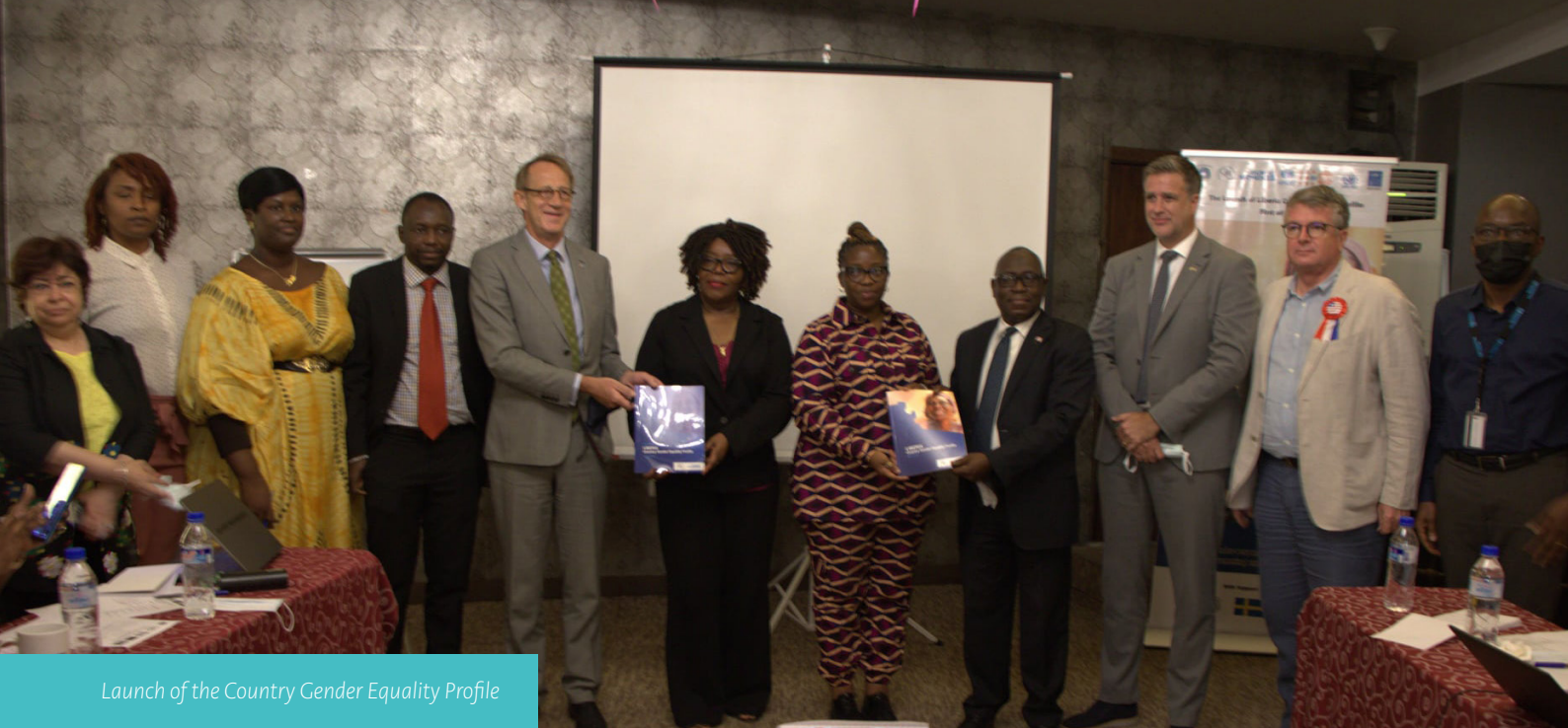
Launch of the Country Gender Equality Profile