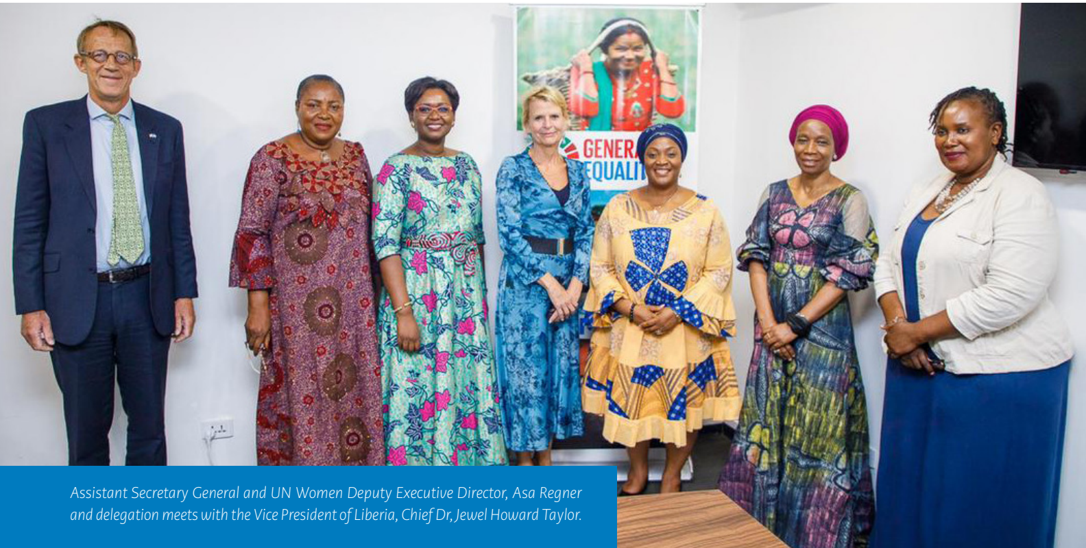
Assistant Secretary General and UN Women Deputy Executive Director, Asa Regner and delegation meets with the Vice President of Liberia, Chief Dr. Jewel Howard Taylor.

A global champion for women and girls, UN Women was established to accelerate progress on meeting their needs worldwide. The entity works to position gender equality as fundamental to achieving the Sustainable Development Goals and a more inclusive world.