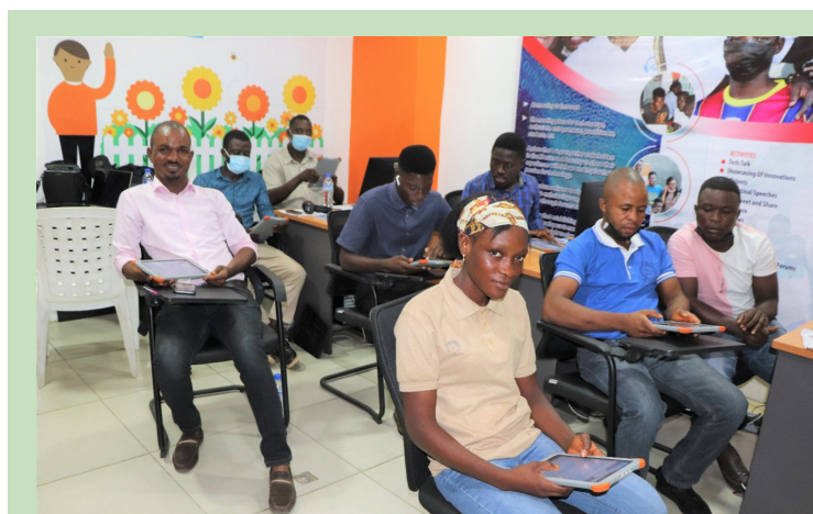
Teachers from selected schools in Phase Two of the Training of Trainers session, under the UN Women Orange Digital School Initiative.

The ODSI provides selected schools in Montserrado, Margibi and Grand Bassa Counties with digital teaching and learning materials comprising laptops, servers and tablets. The digital kits give students access to educational content in maths, science and English in targeted schools but also improve the teaching materials available to teachers.