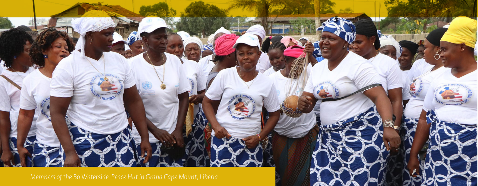
Members of the Bo Waterside Peace Hut in Grand Cape Mount, Liberia