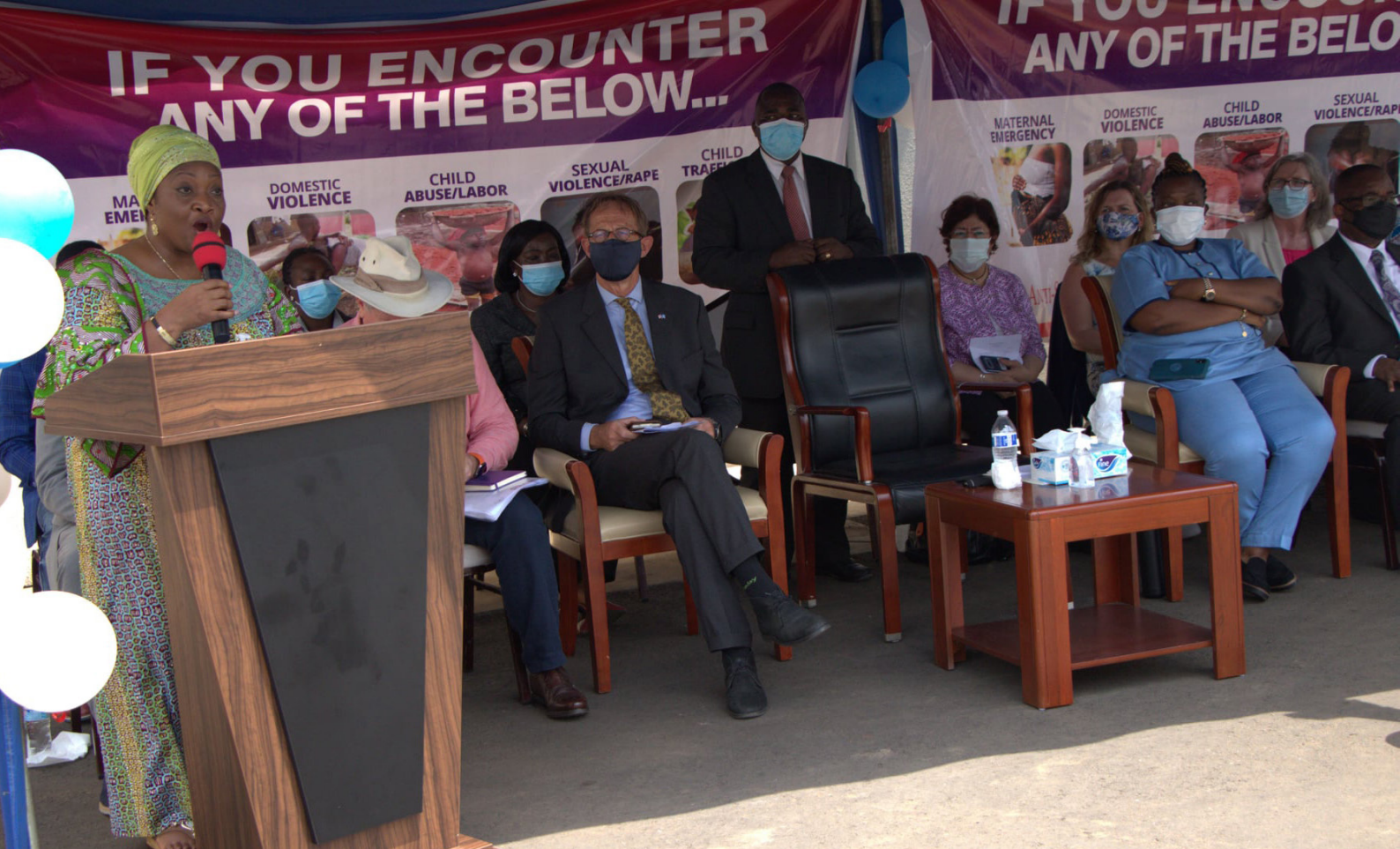
Vice President of Liberia, Chief Dr. Jewel Howard-Taylor officially launched the national anti-SGBV call centre and handed over motorbikes and other vehicles to the anti-SGBV taskforce at the Ministerial Complex in Congo Town, Monrovia, Liberia.