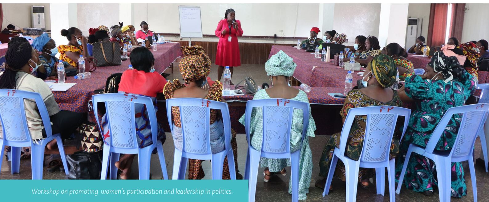
Workshop on promoting women's participation and leadership in politics.

UN Women thanks the Governments of Canada and Sweden for providing financial support for the workshop.