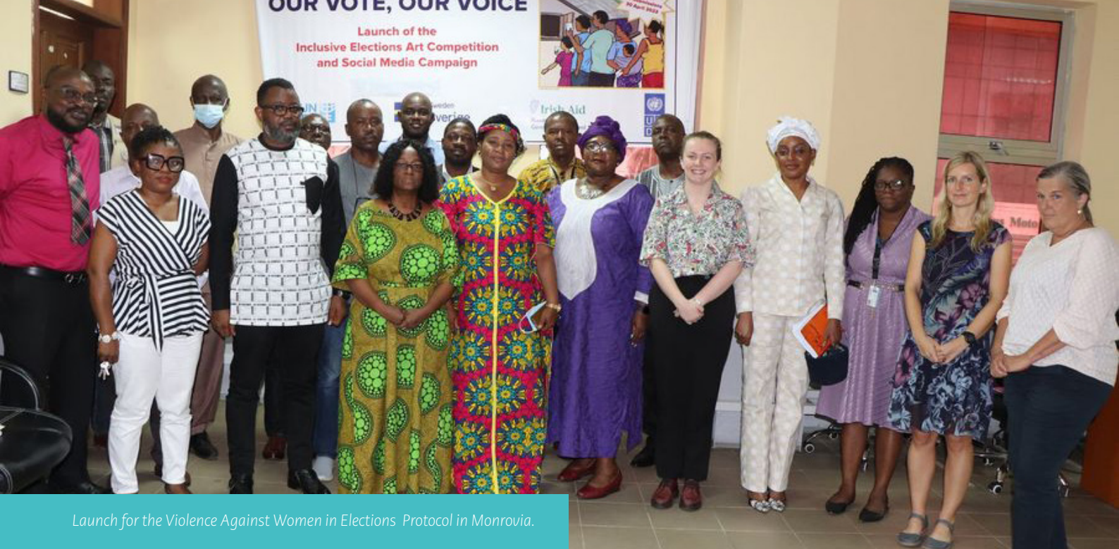
Launch for the Violence Against Women in Elections Protocol in Monrovia.