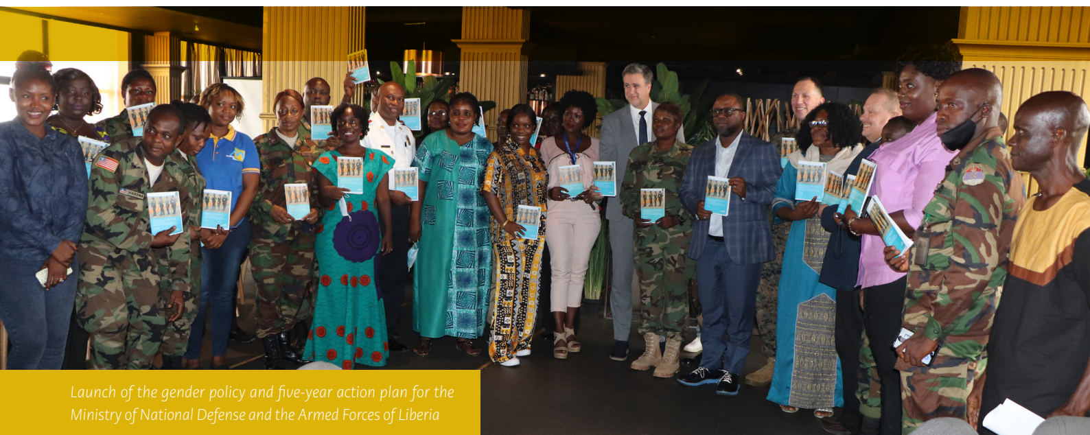
Launch of the gender policy and five-year action plan for the Ministry of National Defense and the Armed Forces of Liberia