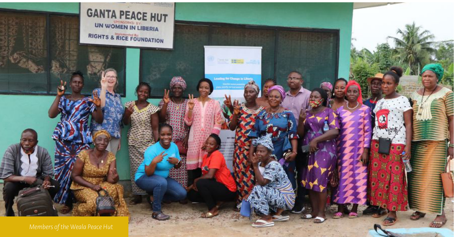
Members of the Weala Peace Hut

Irish Aid is providing funding to UN Women in support of the project ‘Supporting community engagement on women’s political participation’.