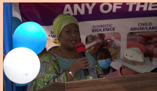
Vice President of Liberia, Chief Dr. Jewel Howard-Taylor officially launched the national anti-SGBV call centre and handed over motorbikes and other vehicles to the anti-SGBV taskforce at the Ministerial Complex in Congo Town, Monrovia, Liberia.

The call centre will be used to address various issues including sexual and gender-based violence, maternal care and child protection. Survivors or anyone who needs support can call 116 to get assistance.