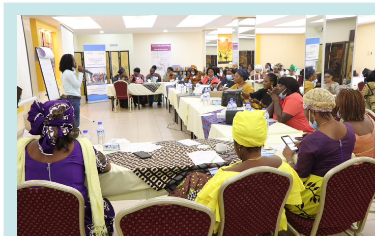
Participants at the high-level dialogue hosted by the African Women Leaders Network Liberia Chapter and the Women Legislative Caucus of Liberia to allow past and current aspiring female candidates from various political parties to share experiences and winning strategies in preparation for elections. UN Women supported the event.