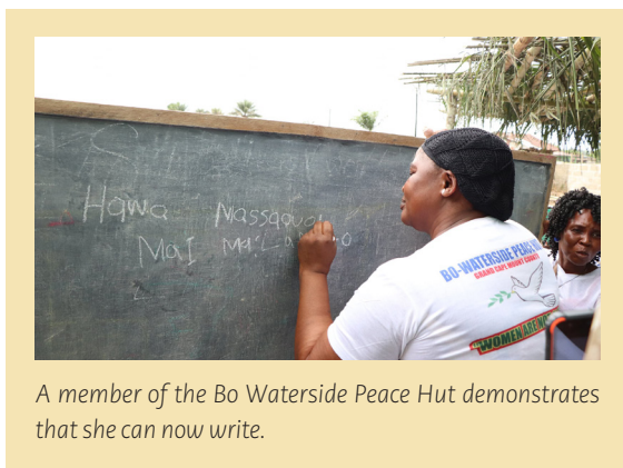
A member of the Bo Waterside Peace Hut demonstrates that she can now write.

Women from the Bo Waterside Peace Hut are grateful that they can now write their names and count a few numbers, something they could not do before. Some members took the opportunity to demonstrate their newly acquired skills.