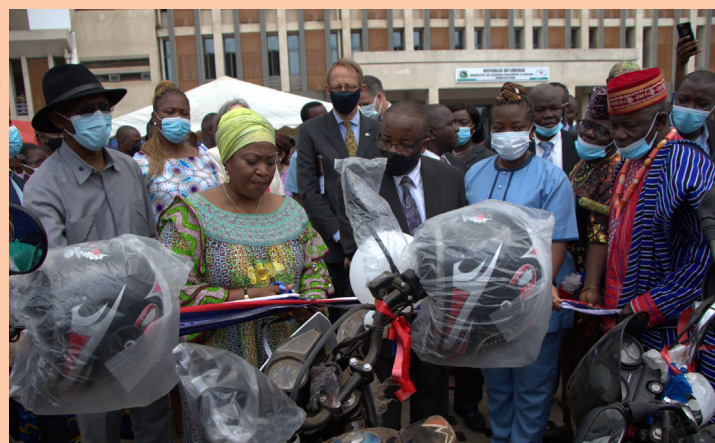
Vice President of Liberia, Chief Dr. Jewel Howard-Taylor officially launched the national anti-SGBV call centre and handed over motorbikes and other vehicles to the anti-SGBV taskforce at the Ministerial Complex in Congo Town, Monrovia, Liberia.

At the same meeting, the Ministry of Gender, Children and Social Protection also handed over motorbikes and other vehicles to the anti-SGBV taskforce to enable them to reach all parts of the country in discharging their duties.