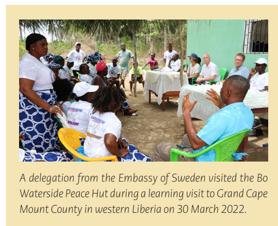
A delegation from the Embassy of Sweden visited the Bo Waterside Peace Hut during a learning visit to Grand Cape Mount County in western Liberia on 30 March 2022.

Peace huts are community centres that women use for conflict prevention, resolution and peacebuilding. The Bo Waterside Peace Hut has 178 members comprising 18 men and 160 women.