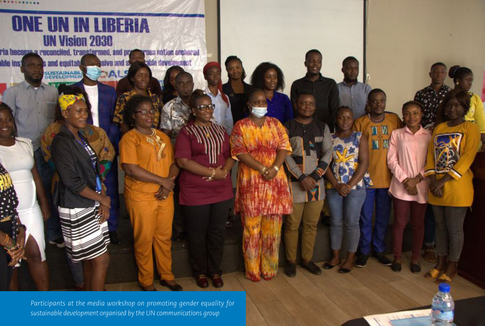
Participants at the media workshop on promoting gender equality for sustainable development organised by the UN communications group