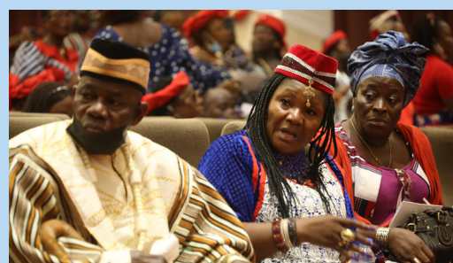
Delegates attending the International Women's Day commemorations.

The United Nations in Liberia supported the Ministry of Gender, Children and Social Protection to host the International Women's Day celebrations.