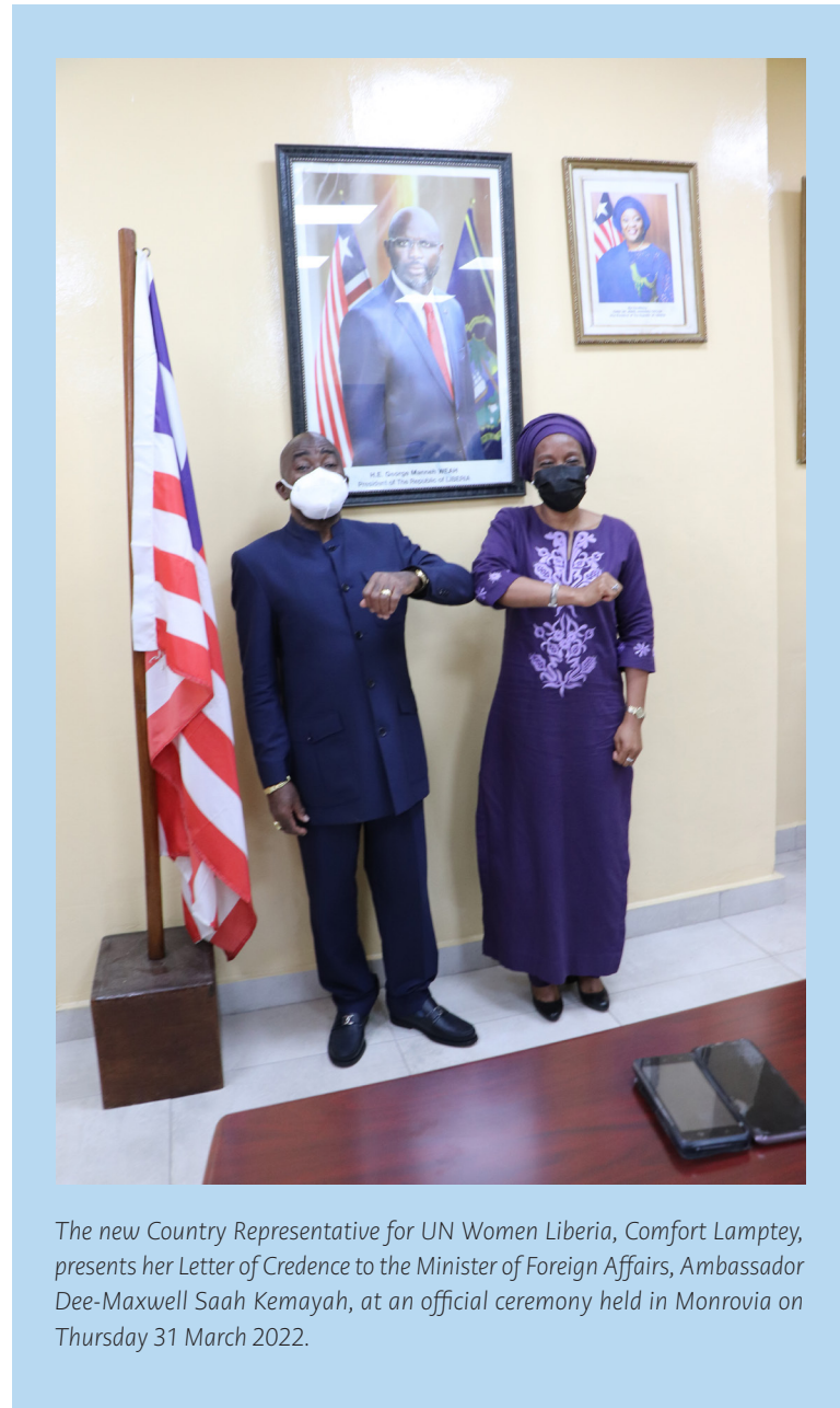
The new Country Representative for UN Women Liberia, Comfort Lamptey, presents her Letter of Credence to the Minister of Foreign Affairs, Ambassador Dee-Maxwell Saah Kemayah, at an official ceremony held in Monrovia on Thursday 31 March 2022.

UN Women began its operations in Liberia in 2004, collaborating with the UN system, line government ministries, implementing partners, women's groups and Liberians from all walks of life to promote gender equality and women's empowerment. UN Women Liberia's strategic direction is tailored towards helping address issues affecting women and girls through five thematic areas: women's economic empowerment; peace, security and humanitarian action; ending violence against women and girls; women's political participation and leadership; and gender-responsive planning and budgeting.