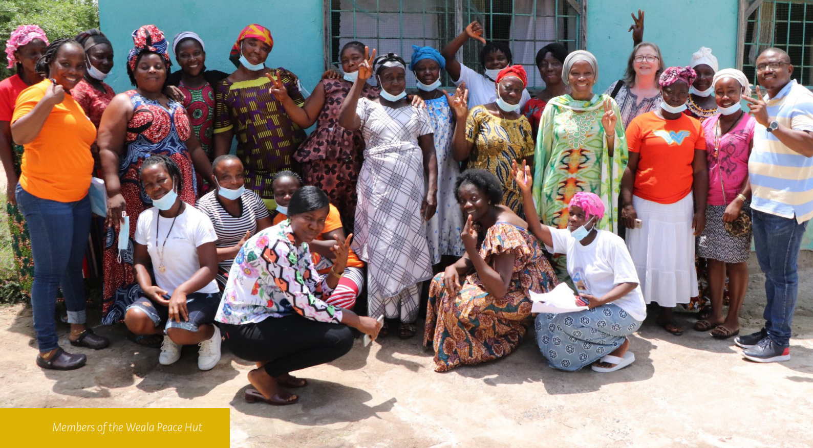
Members of the Weala Peace Hut