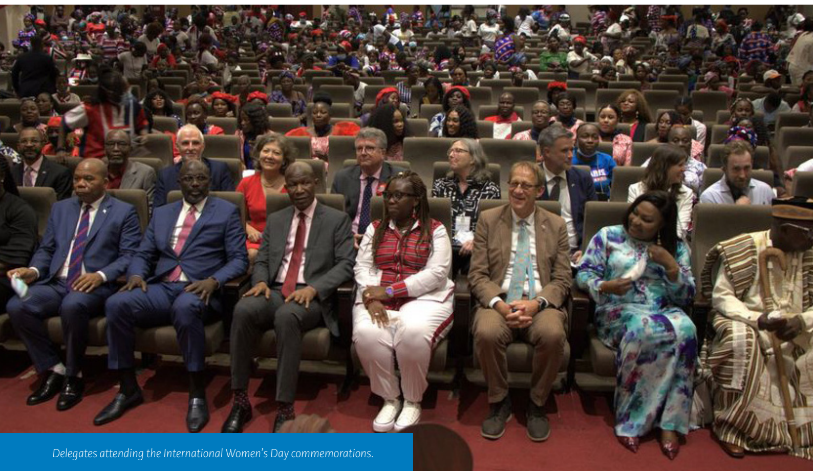
Delegates attending the International Women's Day commemorations.