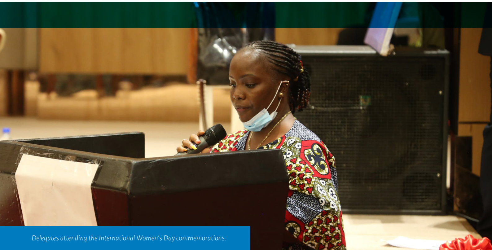
Delegates attending the International Women's Day commemorations.

to breaking barriers and promoting gender equality and a sustainable tomorrow," he said.