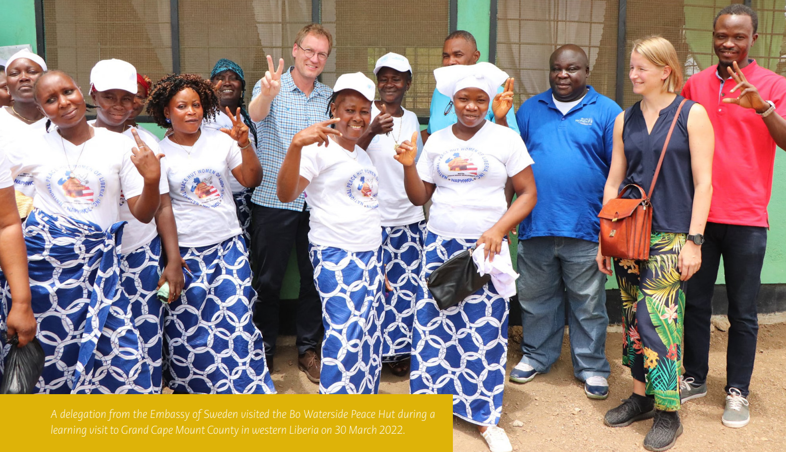
A delegation from the Embassy of Sweden visited the Bo Waterside Peace Hut during a learning visit to Grand Cape Mount County in western Liberia on 30 March 2022.