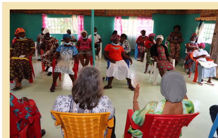
Members of the Weala Peace Hut