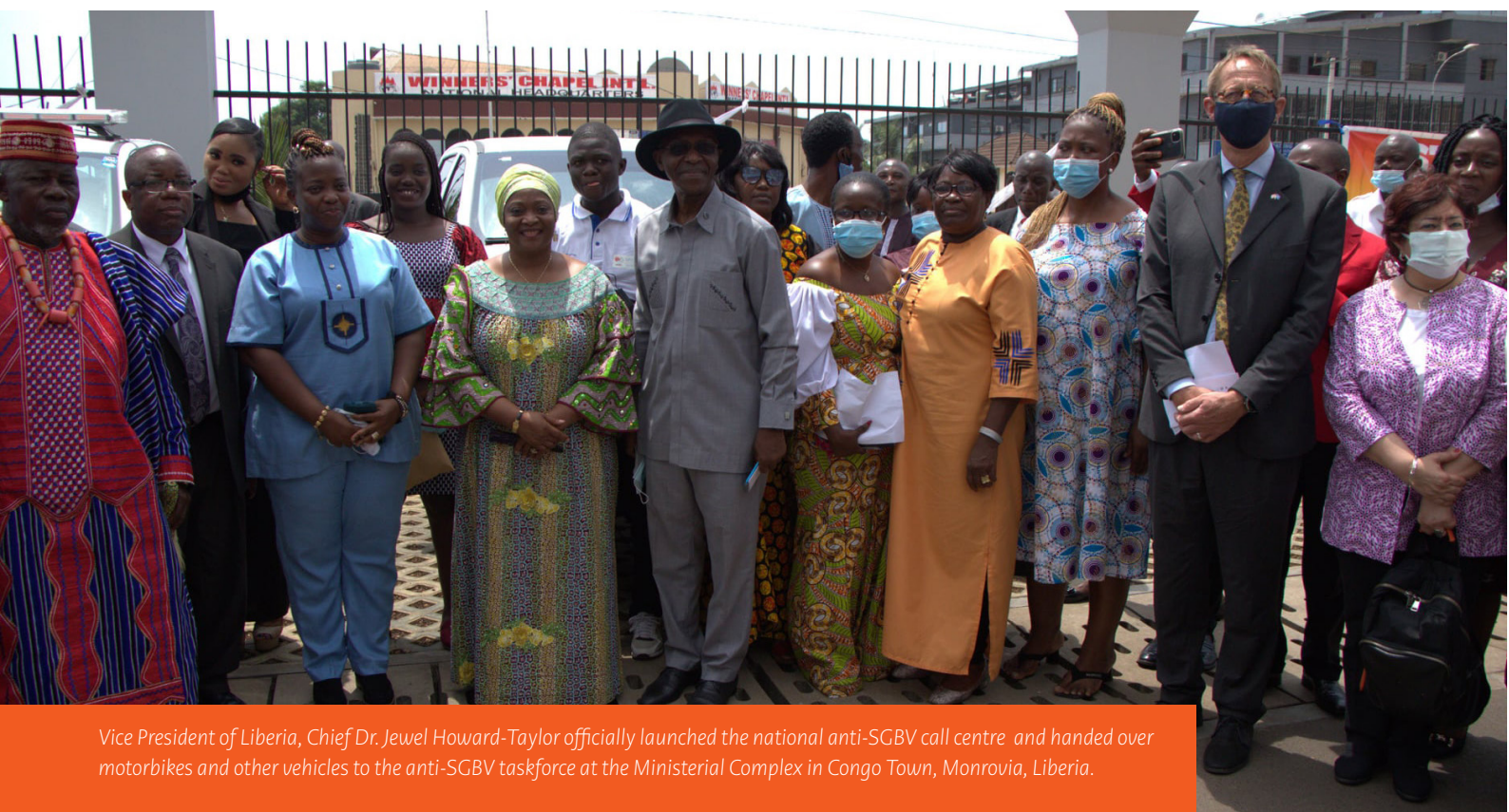
Vice President of Liberia, Chief Dr. Jewel Howard-Taylor officially launched the national anti-SGBV call centre and handed over motorbikes and other vehicles to the anti-SGBV taskforce at the Ministerial Complex in Congo Town, Monrovia, Liberia.