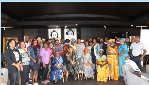
Engagement meeting with partners