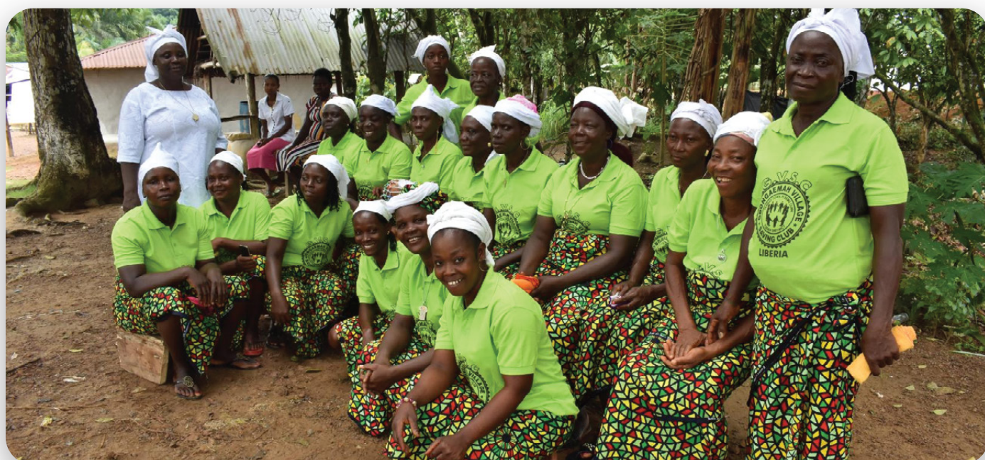
Caption: Traditional FGM practitioners from the town of Sonkay learn alternative livelihood practices following FGM Ban

What comes next for Liberia will depend on continued efforts to build the economy through domestic resources and harness the power and voices of young people. As the UN, we remain steadfast in our support and investment in the country's 'down-stream', data-driven and inclusive development journey in the coming years.