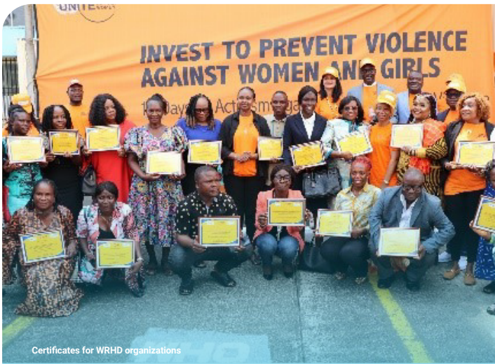
Certificates for WRHD organizations