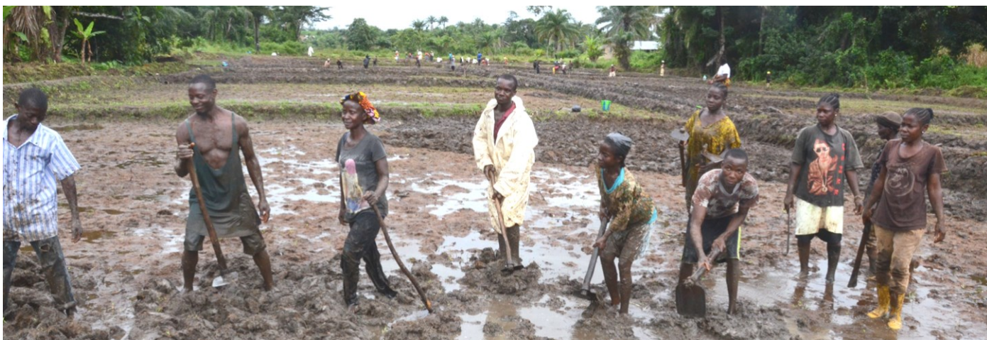
Rural farmers working on their site under the food for assets creation SHAD-P initiative.

According to the CFSNS Report, Liberian households (Bong County included) headed by individuals with little or no education are more vulnerable to food insecurity. The report demonstrates that approximately 28% of household heads have no form of education. Out of these households, 24% were notably food insecure; 21% were moderately food insecure; and 3% were severely food insecure.