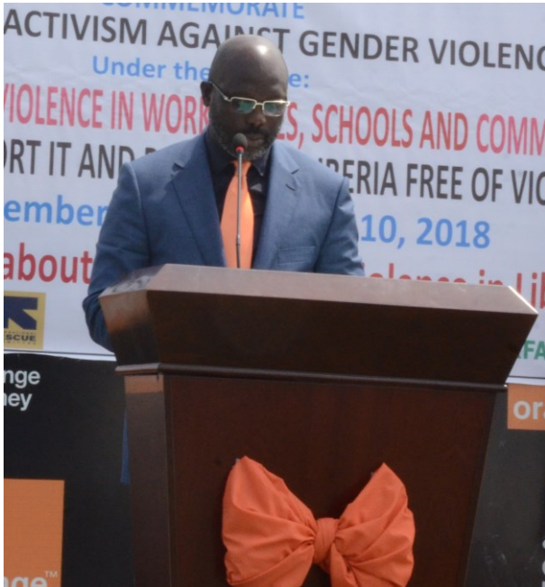
The President of Liberia, H. E. George Manneh Weah, speaking during the launch of the 16 Days of Activism to Eliminate Violence Against Women.

Liberia launched the global campaign 16 Days of Activism to Eliminate Violence Against Women at an event in central Monrovia, attended by H.E. President George Manneh Weah.