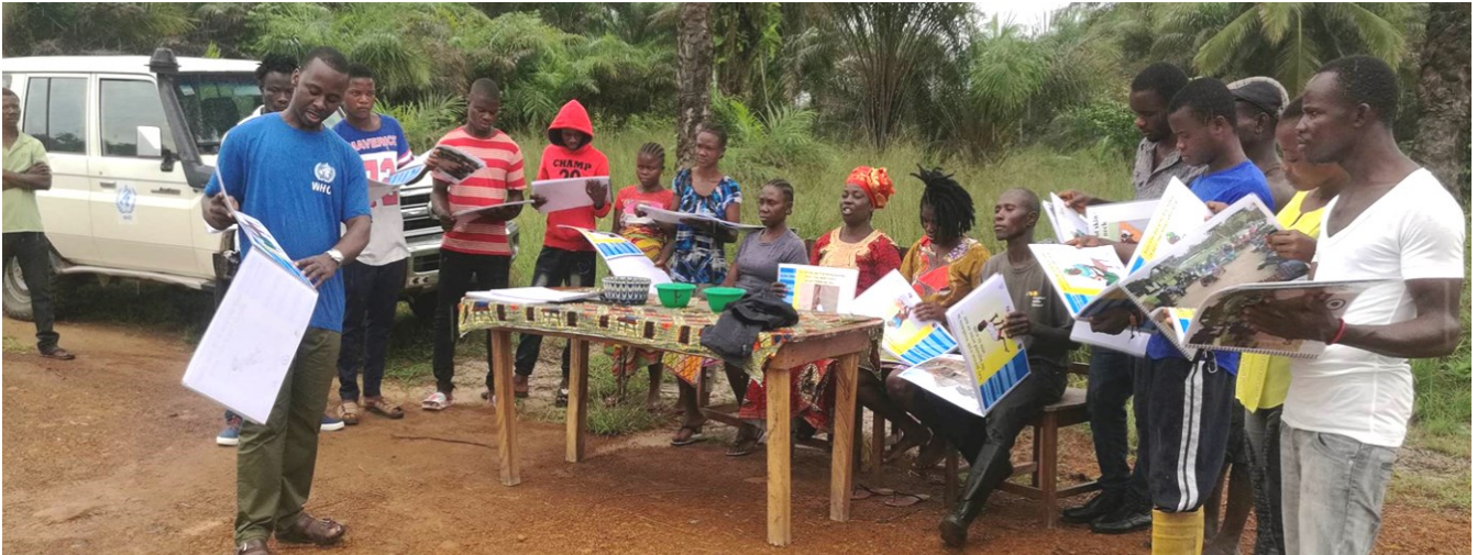
WHO National Epidemiologist sensitizing community Health Volunteers on Integrated Disease Surveillance and priority disease response, Gbarpolu County, Liberia

The World Health Organization (WHO) in Liberia, in collaboration with the Ministry of Health and National Public Health Institute of Liberia, has supported the training of 450 community health volunteers from three counties: Bomi, Grand Cape Mount and Gbarpolu.