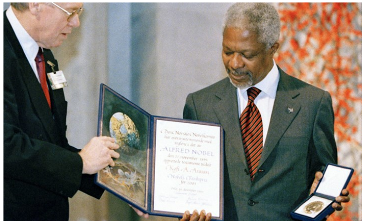
As UNSG, Annan galvanized global action to fight HIV/AIDS and combat terrorism. Mr. Annan and the United Nations jointly were awarded the Nobel Peace Prize in 2001.