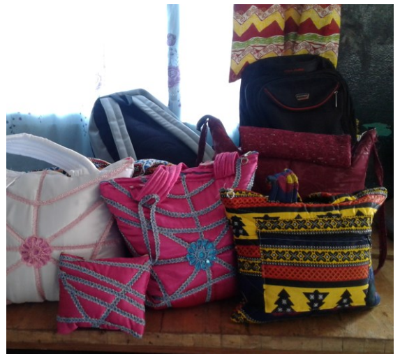
(L) Fistula survivors sing during their graduation ceremony. (R) Some of the products from the Fistula Rehabilitation and Reintegration Center.