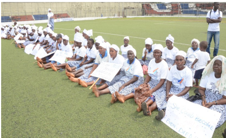
Women holding placards in protest against SGBV during the launch of the 16 Days of Activism.