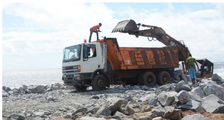
Truck offloads rocks at the project site in New Kru Town.

The Ministry of Mines and Energy, in collaboration with the Environmental Protection Agency (EPA), is responsible for the procurement of equipment, rocks, geo-fabric mats, and the services of temporary staff, while as a key implementation partner, UNDP is in charge of hiring the core project staff, including an international coastal engineer; who has completed baseline surveys and recommended appropriate project designs.