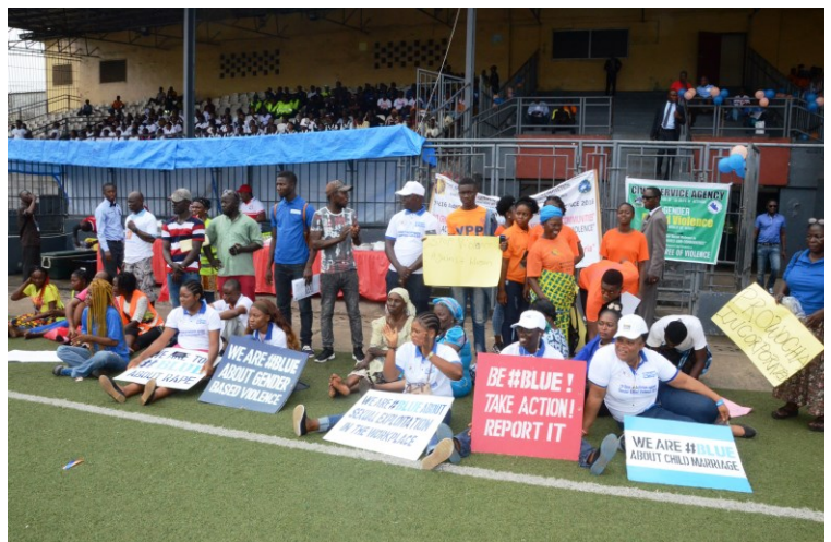
Participants holding signs with messages highlighting violence against women and girls and the need to curb it.

Also speaking at the event, the Minister of Gender, Williametta Saydee Tarr, re-echoed President Weah and the UNSG’s sentiments about violence against women, saying “gender-based violence remains a major threat to human security of women and children in Liberia and around the world.”