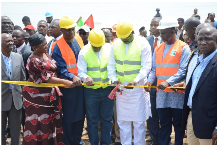
H.E. President George Manneh Weah cuts the ribbon launching the coastal defense project.

New Kru Town has a population of over 20,000 inhabitants, and along with the high school, hosts