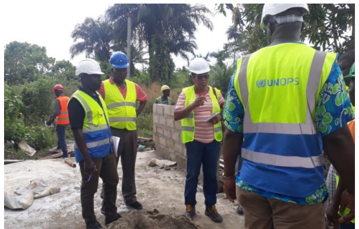
UNOPS and stakeholders jointly conducting routine project site inspections.

Engagement and partnership: With University of Liberia, Environmental Protection Agency, Liberia Fire Service, One UN House Facility Management Unit.