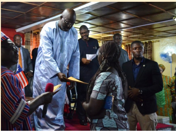
President Weah presents a former Sierra Leonean with her Certificate of Citizenship.

On 23 July 2018, the President of Liberia, George M. Weah, presented Certificates of Citizenship to 50 former Sierra Leonean refugees. These 50 certificates are part of the total of 300 Certificates of Citizenship handed to former Sierra Leonean refugees fully integrated in Liberia since 2008. With these documents the former refugees now have more opportunities to empower their self-sufficiency and integration in Liberia.