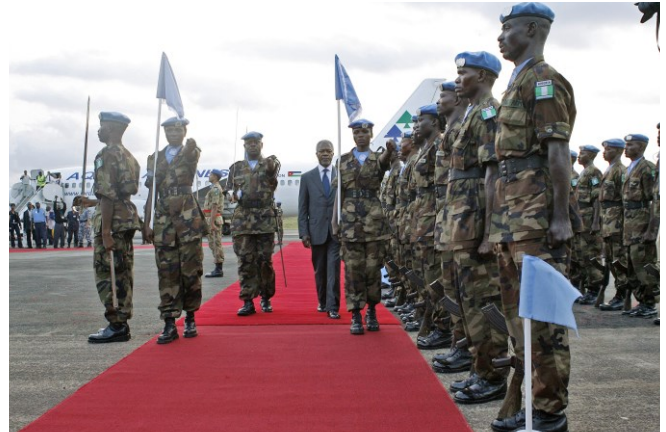
Former SG reviews UNMIL Nigerian Honor Guard.

During his time in Liberia, Annan was also invested by President Ellen Johnson-Sirleaf with the highest honour in Liberia: the Grand Order of the Knighthood of Pioneer.