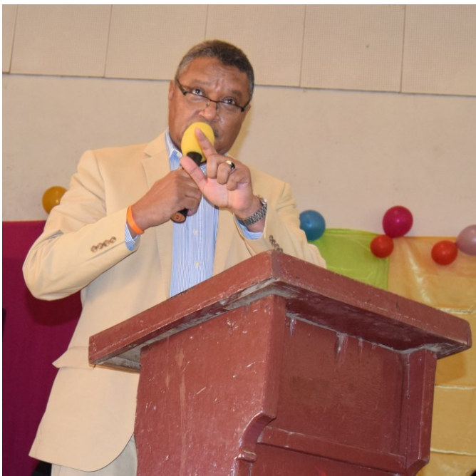
UN Resident Coordinator, Yacoub El Hillo delivering special messages from the Secretary-General.

Human Rights Day is observed every year on 10 December, the day the United Nations General Assembly (UNGA) adopted, in 1948, the Universal Declaration of Human Rights (UDHR).