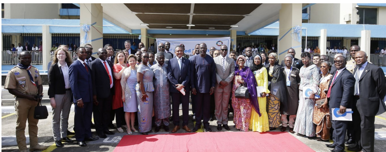
Group photo after the official 73rd UN Day Celebration.

The flag raising ceremony was the official programme marking two days of events under the theme "From peacekeeping to sustainable development in Liberia". The events included sporting activities involving all UN Agencies, Funds and Programmes and a radio talk show with heads of agencies.