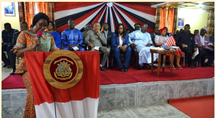
“Liberia is a commendable example of a country with overwhelming potential and generosity in terms of providing a favourable protection environment to refugees and other persons of concern”, stated Fatima Mohammed-Cole, UNHCR Liberia Representative.