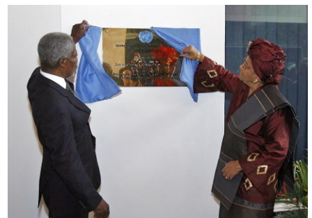
(L): Former SG interviewed by UNMIL Radio. (M and R): Former SG and Former President of Liberia attend the Inauguration of UNMIL Headquarters.