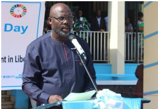
H.E. George Manneh Weah speaking at the 73rd UN Day Celebration at One UN House in Monrovia.

On 24 October, the United Nations in Liberia commemorated the 73rd United Nations Day with a flag raising ceremony. The celebration was attended by President H. E. George Manneh Weah, members of the diplomatic corps, development partners and international guests from the Kofi Annan Institute-Ghana, a delegation from the UN in Zambia, heads of agencies and UN staff in Liberia.