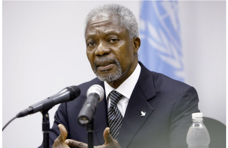
Former UN Secretary-General Kofi Annan speaks to the media in the UN Mission in Liberia (UNMIL) press room on 5 July 2006.

Immediately prior to his appointment as Secretary-General in January 1997, Annan headed the UN Department of Peacekeeping Operations during a period which saw an unprecedented growth in the United Nations’ field presence.